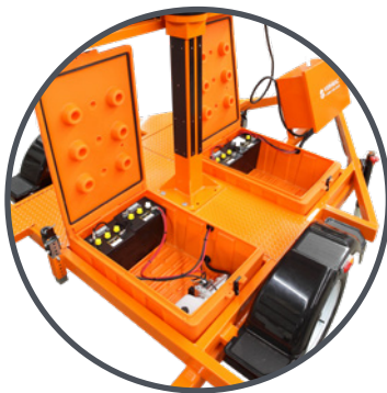
STANDARD MESSAGE SIGN BATTERY STORAGE.