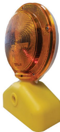
RADAR 4G MODEM WITH GPS LITHIUM BATTERY SOLAR REGULATOR

Ver-Mac's Speed-Mac 2.0 is a portable sensor system packaged inside a standard barricade light. The components include a doppler radar, 4G modem with GPS, a lithium battery and a solar regulator. Attach the Speed-Mac 2.0 to any battery/solar powered device or to the innovative Speed-Mac VP design. Speed-Mac 2.0 is designed to provide speed data for smart work zones and traffic studies.