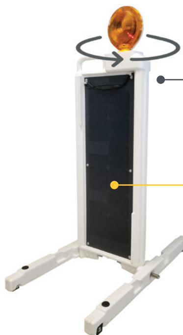
AUTONOMOUS DEVICE MASH TESTED

Ver-Mac's Speed-Mac VP is a patent-pending design that combines the Speed-Mac 2.0 with vertical solar panel. It can be easily set up by one man and will operate all season without recharging in most applications. The Speed-Mac VP is the only autonomous MASH tested and approved device on the market.