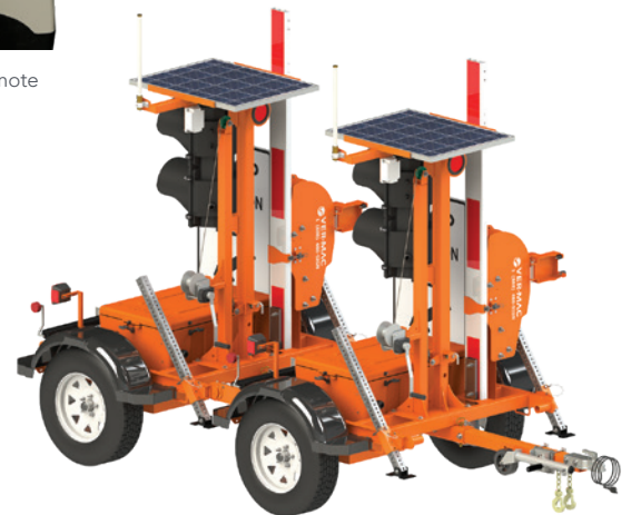
Nested Tow Position