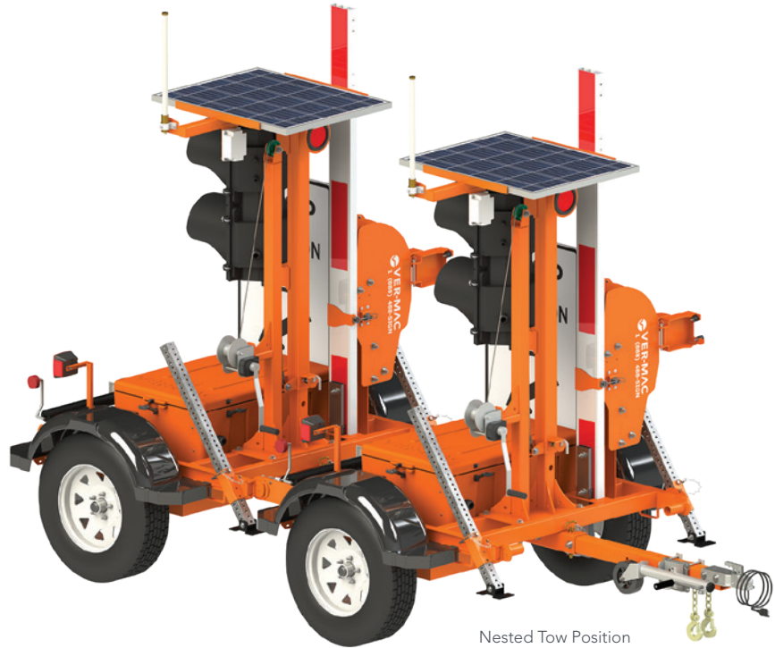
Nested Tow Position