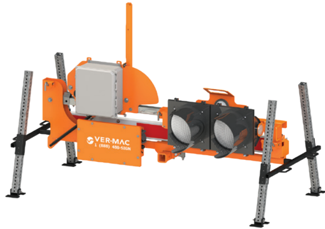
Storage stand option

Balances the equipment's weight, allowing effortless deployment