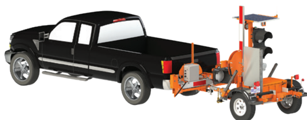
Combo units - Transport

Save on fuel: the unit operates without running the truck engine